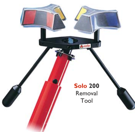
Solo 200 Removal Tool