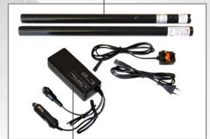
Solo 726 Fast Charger